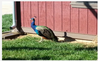
Peacock at Temple Hills Farm Park, ready for the NSA meeting!

Mark your calendars now and register on line for the NSA Holiday Social! Wednesday, December 12 th at Brion's Grill in Fairfax Station (across the